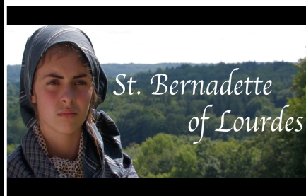
St. Bernadette of Lourdes

Many people call or come to the office seeking a sponsor letter from the Church. Sponsors, a Godparent for Baptism of Sponsors for confirmation, by church law. They have to be Catholics in good standing. That means they are registered in a parish, practicing their faith by weekly attendance at Mass and regular reception of sacraments, must have been married through the church. Such qualities provide a good and objective framework for fulfilling the role of a catholic sponsor whose first duty is to assure the Catholic formation and education of the child.